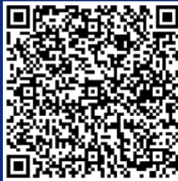
ONLINE SAFEGUARDING POLICY

Please follow these QR codes to access relevant policies for further information about our Online Safeguarding practise.